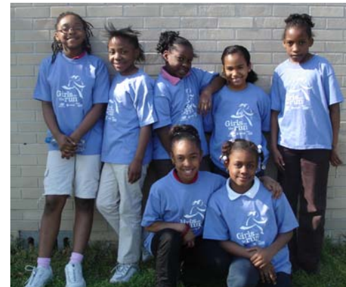
Girls On The Run

The C. Waldo Scott Center is a special place for children and families in Newport News to receive comprehensive services, which are developed to meet the needs of the community. Bringing together educators, health care professionals, social workers, recreation specialist, and community members to provide the education, training, and support needed for young people and their families to develop the skills necessary to take charge of their lives, enhancing positive life skills, health, education, and employability.