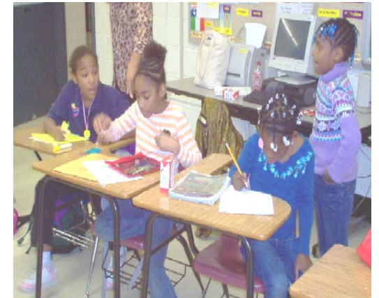
After School Program with H.I.K.E.

Programs at the Scott Center are available to young people ages 6 to 18, and their family members. The Scott Center also provides specific services for special populations when the need and interest arises. While we encourage young people and their families to join the Scott Center, and participate in our programs, individuals may also be referred by schools, community based organizations/agencies (public & private), churches, friends, or family.